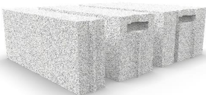
Configuration with profiled surface

This declaration, including data collection and the modelled foreground system including results, represents the production of the autoclaved aerated concrete products on the production site located in Germany. Product specific data are based on average values collected in the year 2021. Background data are based on the GaBi LCA software and are less than 10 years old. Generally, the used background datasets are of high quality, and the majority of the datasets are only a couple of years old.